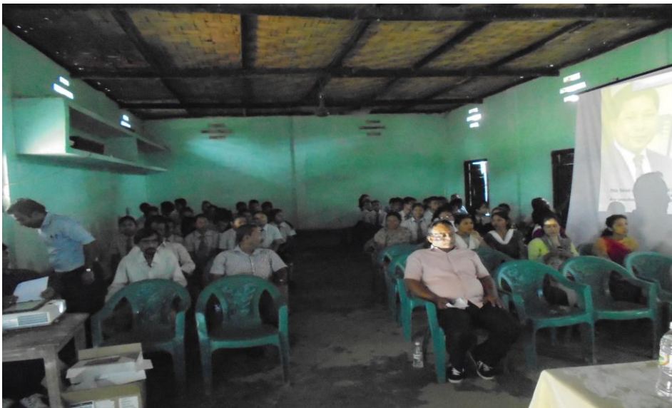
Fig: Government officials, school students, teachers attending the program.