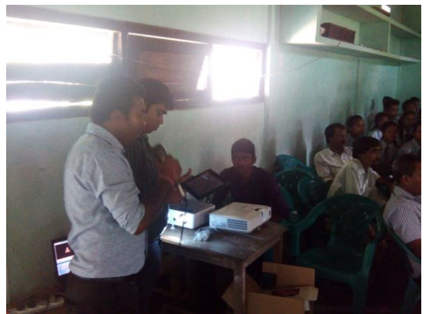
Fig: Technical Personnel from Nice Infotech giving a demonstration to the students and teachers on how to use a Tablet with a Projector which have been handed to Resubelpara Girls Hr. Sec. School, Resubelpara as part of Digital Classroom Program of IT Department, Government of Meghalaya.