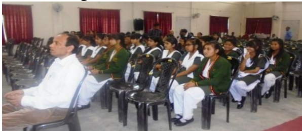
Students of Govt Girls H. S. School