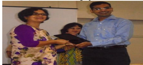
Handing over tablet to Teacher