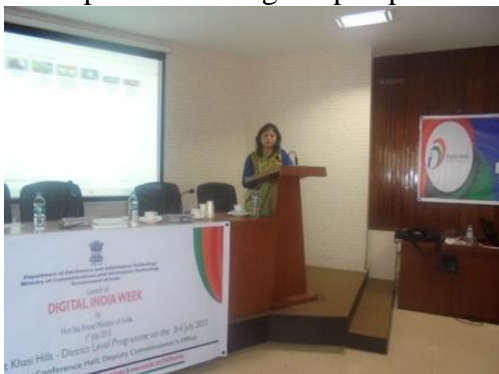
Speech by ADC