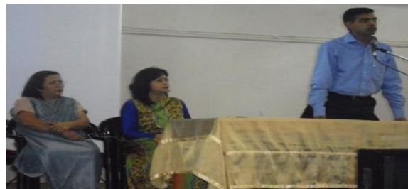
DC delivering speech