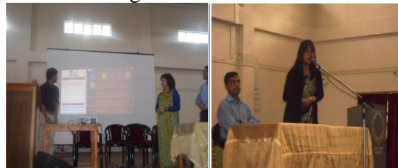
Speech by the Principal Govt Girl's School