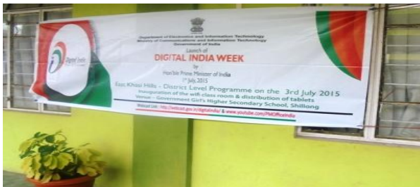
Digital India Week Banner

The programme at Government Girls higher Secondary School started at 3 pm, where the Deputy Commissioner was the Chief Guest. The audience were the School students and the teachers of the school. After a speech on digital India, the Deputy Commissioner distributed the tablet to the teachers. Later on, a wifi class room was inaugurated and pamphlets/ leaflets were distributed as part of awareness programme on digital india.