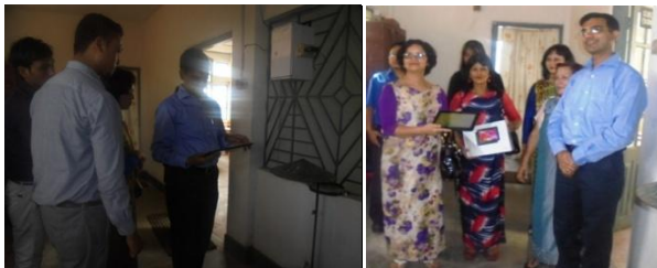
Inauguration of Wifi Class room