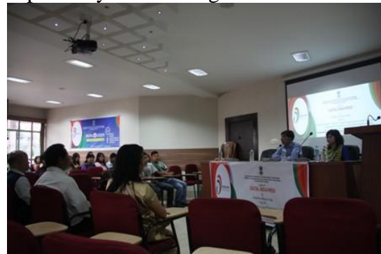
Speech by DC