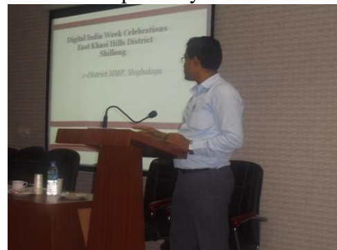
Speech by PWC on e-District