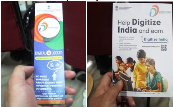
Participants browsing the pamphlet /leaflet