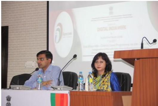
Speech by DC

A vote of thanks was shared by the ADC and finally all the participants rose up for the National Anthem.