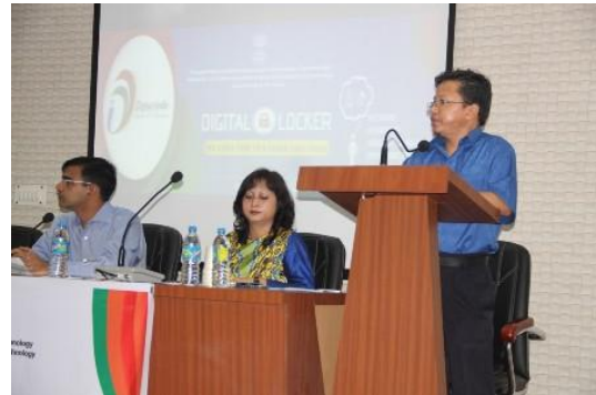
Speech by DIO on Digital India & Aadhaar